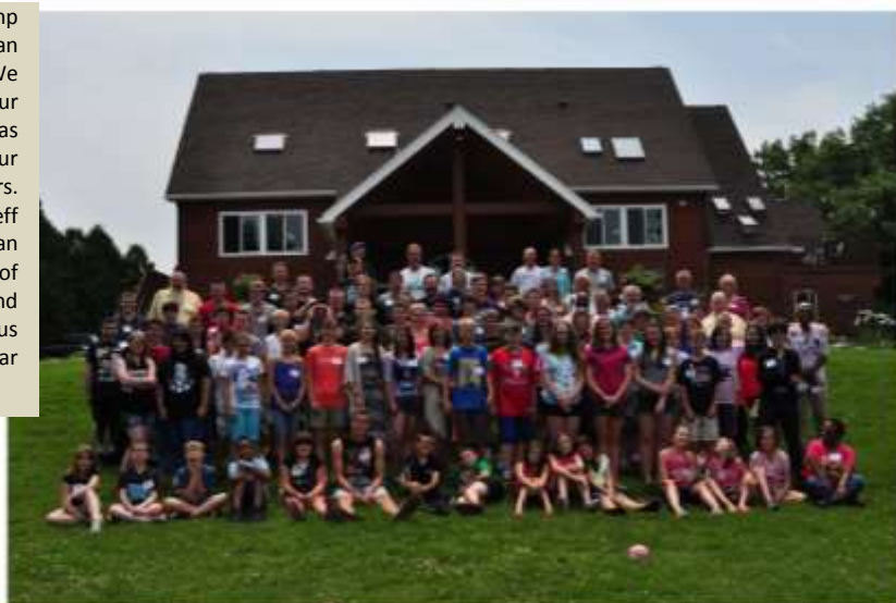
Camp Constitution 2015

This year's camp promises to be an excellent one. We welcome all our new campers as well as our returning campers. Mr. Hal Shurtleff has assembled an exciting panel of instructors and planned fabulous extra curricular activities. ★